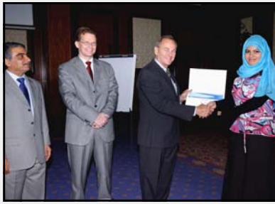
Attendees at VEGA/ETT Import/Export Management and Marketing Workshop in Bahrain, June 2006