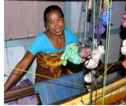
An artisan from the workshop Aagor Daaga Afad, in Rowmai, Assam, India, weaving a textile in the traditional Bodo style.

Over the past 10 years, Aid to Artisans has raised the incomes of over 125,000 artisans in more than 41 remote countries to improve their lives, the lives of their families, and their communities.